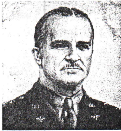
MAJ. GEN. OSCAR WESTOVER

MAJ. GEN. OSCAR WESTOVER, a graduate of West Point in 1906, served 10 years in the Infantry before transferring to the Signal Corps. He was a rated pilot in both airships (in 1922 he won the national elimination free balloon race) and airplanes. In the 20's, although now past 40, he continued to sharpen his pilot proficiency by attending the tactical and flight attack schools.